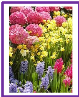
Spring Flowers ... Pinterest