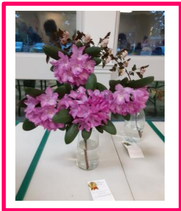
Other: Photos from the June Flower Show