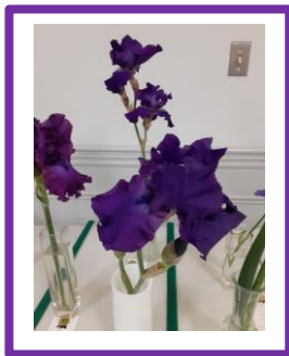
Iris from the June Flower Show