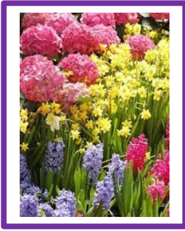
Spring Flowers ... Pinterest